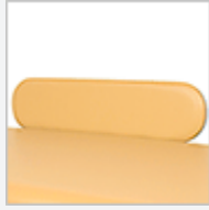
A14 Side Pads Provide additional patient safety. Fold down