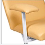
A8 Arm Supports Arm supports can be raised/lowered. Detachable.