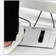
O27 Alternative electronic double footswitch control.