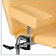
A7 single/ A11 pair Phlebotomy Arm Shaped adjustable arm fits into side of unit. Detachable.