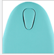
O24 Integral nose hole in head section with wedge to plug hole.