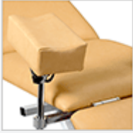
A6 Leg Troughs Can be raised/lowered/rotated. Detachable.