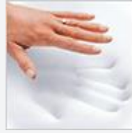
O25 Additional top layer of pressure relieving memory foam.