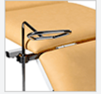
A5 Ankle Stirrups Can be raised/lowered/rotated. Detachable.