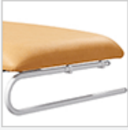
A1 Towel Rail Allows full extension of paper over couch.