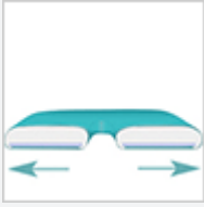
O21 Additional +3" width on couch. Other widths to order.