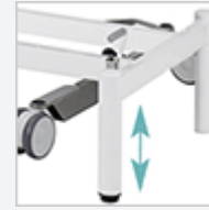
Base Base variant allows hoist access. Bespoke sizes available.