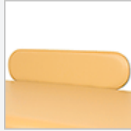
A14 Side Pads Provide additional patient safety. Fold down.