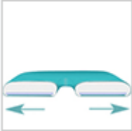
O22 Additional +3" width on couch. Other widths to order.