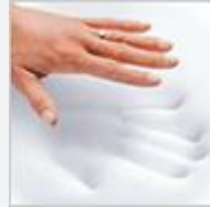
O25 Additional top layer of pressure relieving memory foam.