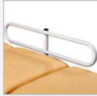
A2 Side Rails Provide additional patient safety. Fold down.