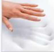
O25 Additional top layer of pressure relieving memory foam.