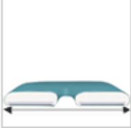
O21 Additional +3" width on couch. Other widths to order.