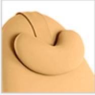
A3 Head Cushion Provides patient support. Detachable.